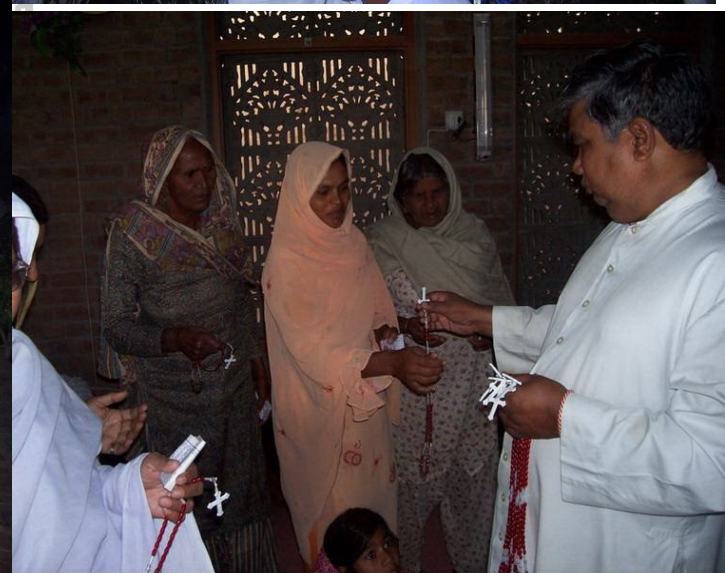
Distribution of Rosaries, Scapulars and Medals