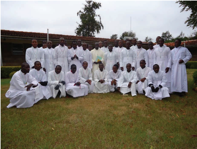
Below are a few pictures of second year seminarians from Apostles of Jesus Philosophicum, Nairobi, Kenya